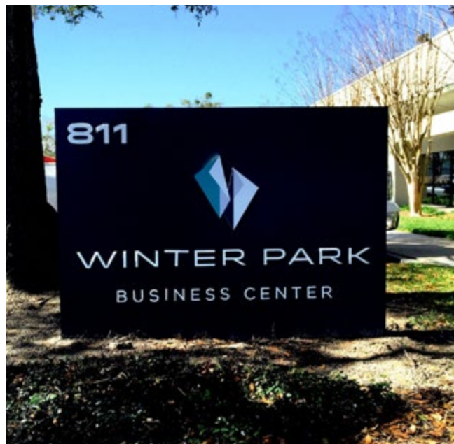
New Signage Throughout Property

TIFFANY ZULLO 407.659.0120 ext. 114 tzullo@towerrealtypartners.com